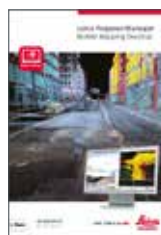
Leica Pegasus:Manager Mobile Mapping Desktop

Copyright Leica Geosystems AG, 9435 Heerbrugg, Switzerland. All rights reserved. Printed in Switzerland – 2018. Leica Geosystems AG is part of Hexagon AB. 847023en – 05.18