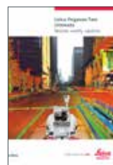
Leica Pegasus:Two Ultimate Mobile Reality Capture