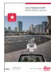
Leica Pegasus:Swift Mobile Reality Capture