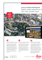
Leica TruView Enterprise