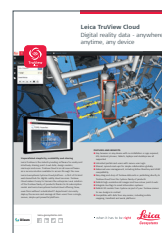
Leica TruView Cloud

Copyright Leica Geosystems AG, 9435 Heerbrugg, Switzerland. All rights reserved. Printed in Switzerland - 2017. Leica Geosystems AG is part of Hexagon AB. 865503en - 11.17