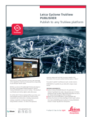
Leica Cyclone TruView Publisher

Leica Geosystems AG Heinrich-Wild-Strasse 9435 Heerbrugg, Switzerland +41 71 727 31 31